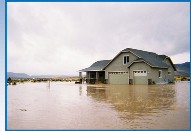
Flooded home in Dayton, Nevada, 2005.