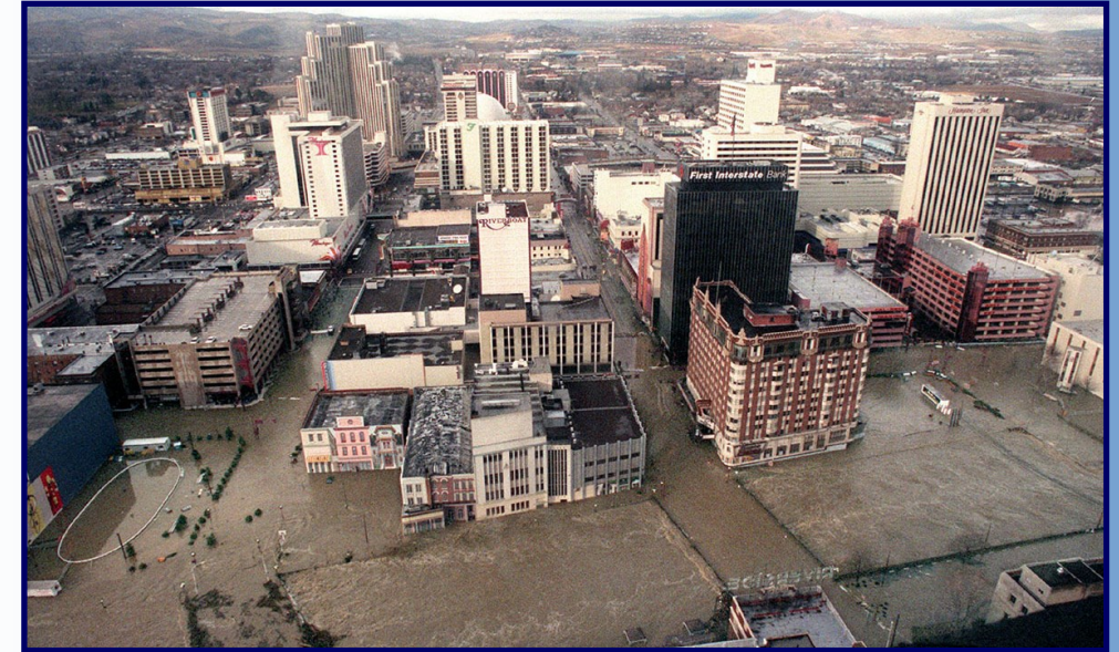
January 1997 flooding in downtown Reno, Nevada.

In Nevada, we have both flash floods and river floods even though most of us live in a desert environment. Whether you live near the foot of a mountain canyon, a dry wash, or on the floor of a broad river valley, you should make preparations ahead of time for damaging flood events. A team of local government officials and educators have worked with the Nevada Division of Water Resources to create an award-winning new website, http://www.NevadaFloods.org . Are you prepared?