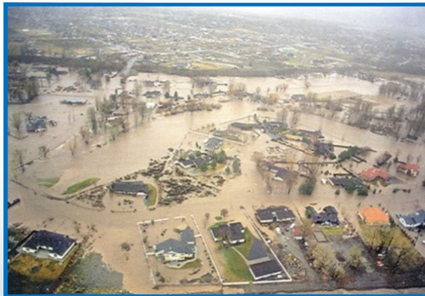
Flooding of homes in Gardnerville, Nevada, 1997.