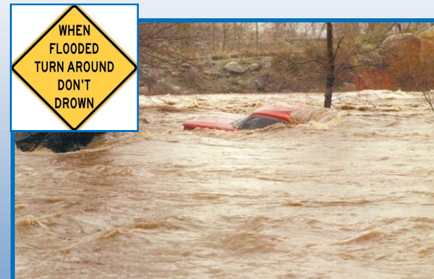
Car trapped in the Truckee River, Verdi, Nevada during January 1997 flood.